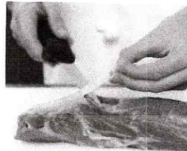
1. Use paring knife to remove any silverskin or extraneous fat from tenderloin.