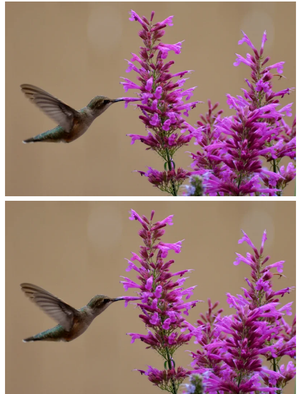
A Hummingbird Visits Ava Agastache.

I always advise my fellow gardeners to get out into their gardens in late July and August to have a thoughtful look around. Take a notepad and write down your observations about where you could use more color, and decide what colors would look best. Consider our pollinators - the bees, butterflies, and hummingbirds that feast in spring also need to feed through the fall months in preparation for winter. Our gardens can make a huge difference.