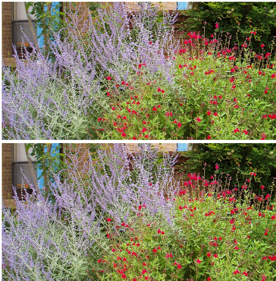
Blue Spires Russian Sage and Furman's Red Texas Salvia