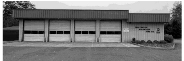
Current photo of fire station

BECOME A VOLUNTEER – We are always accepting applications for new volunteers! If you are interested and would like more information in becoming a member, please call (434) 234-4449 or visit the fire station! Thank you in advance for your continued support!